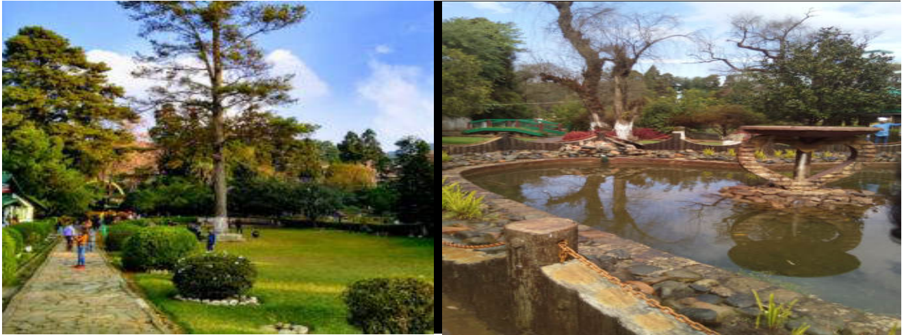
KA PHANG NONGLAIT PARK