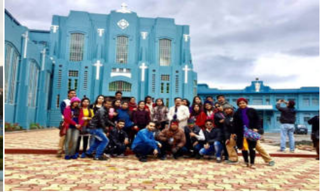
CATHEDRAL CATHOLIC CHURCH